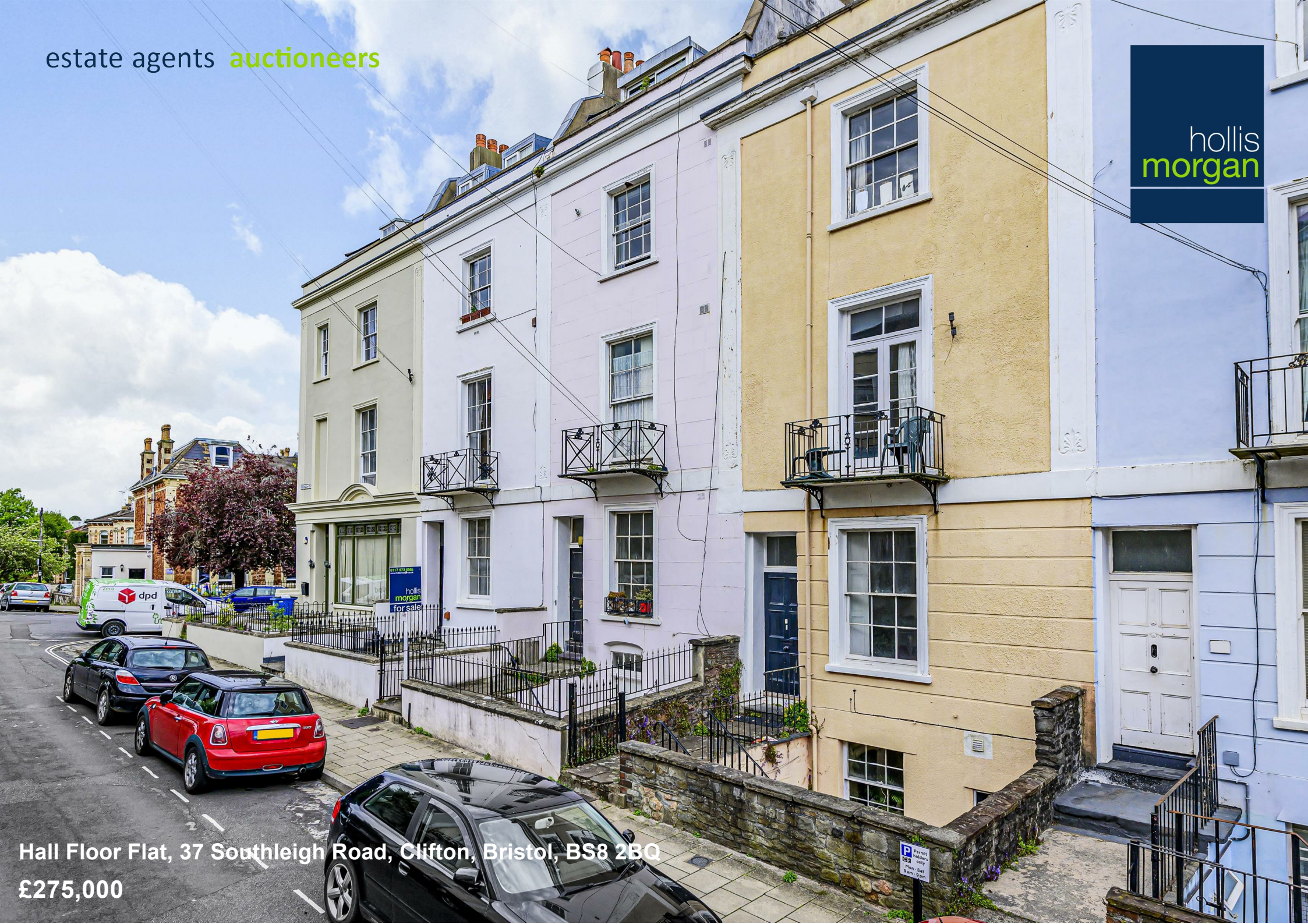
Hall Floor Flat, 37 Southleigh Road, Clifton, Bristol, BS8 2BQ